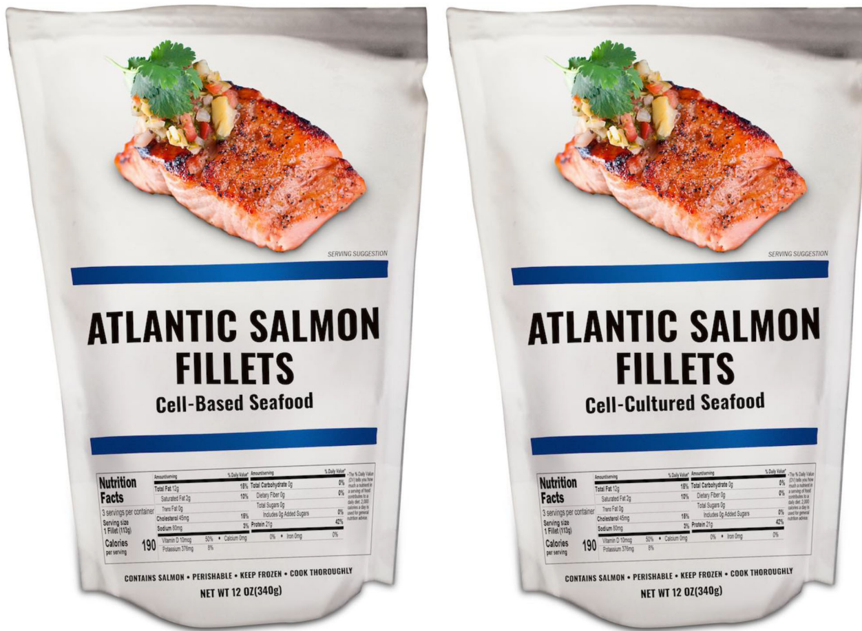
FIGURE 1 Package images

Community Survey (ACS). Of these 1600 participants, 1200 were randomly assigned to complete one of the two experimental conditions reported in this study. A total of 591 participants viewed packages displaying the common or usual name, “Cell-Based Seafood,” whereas 609 viewed packages displaying the common or usual name, “Cell-Cultured Seafood.” Sampling error associated with N = 600 is \pm 4\% when projected to the population.