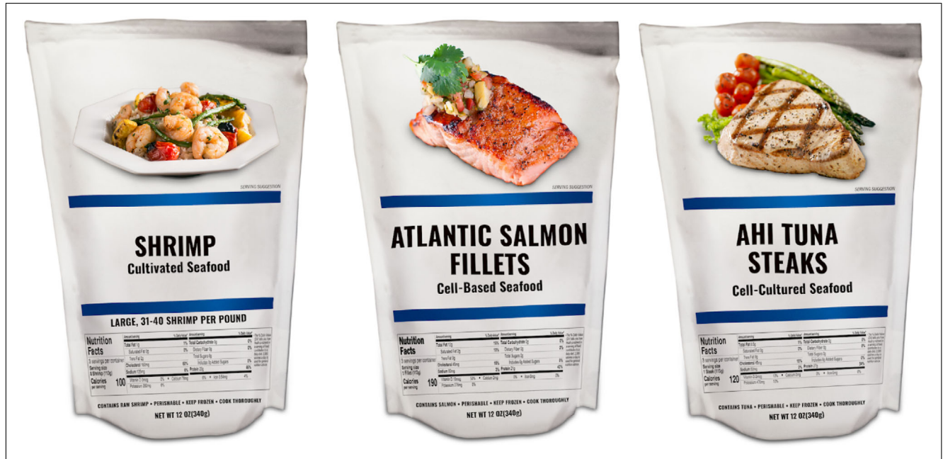
Figure 1—Examples of package images.

with post hoc comparisons made using the Tukey’s HSD test. Differences in proportions were analyzed using z -tests of column proportions with Bonferroni correction. In all statistical tests, a significance level of 0.05 was established to distinguish significant differences.